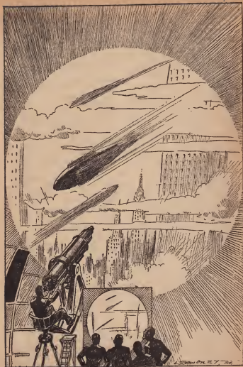
At various times the mist which covers the surface of the planet was broken to reveal . . . cities that towered high into its atmosphere, great cylinder-like airships.